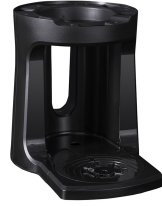
FUNNEL ASSY, SMART COFFEE BLK-CLEARED